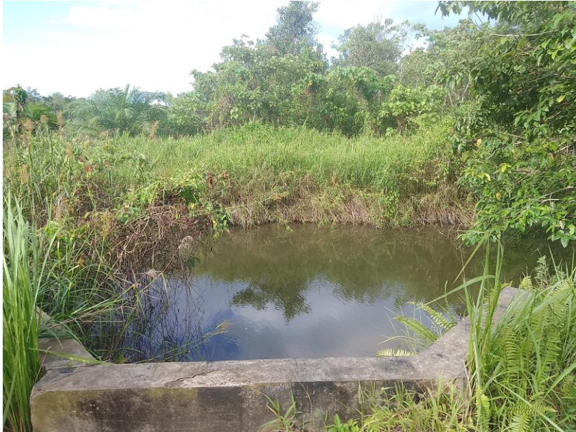
Lampiran 4. Sungai Pasang Surut