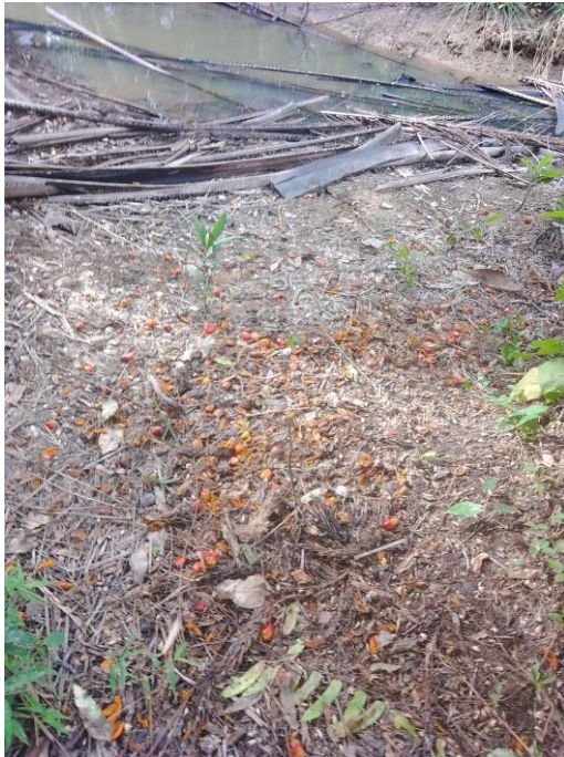
Lampiran 10. Hama Babi