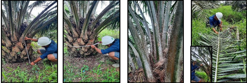
Pengamatan Blok E-29