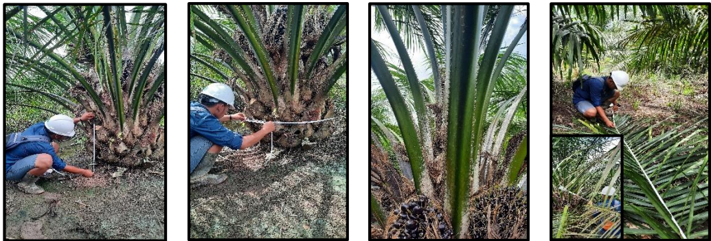
Pengamatan Blok F-29