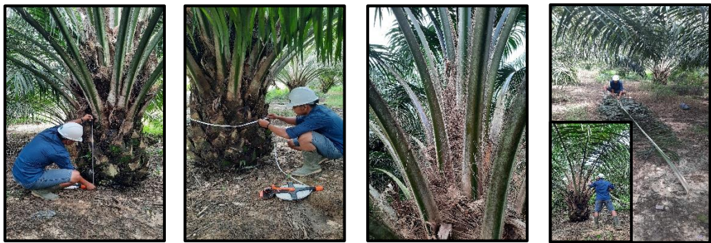
Pengamatan Blok G-35