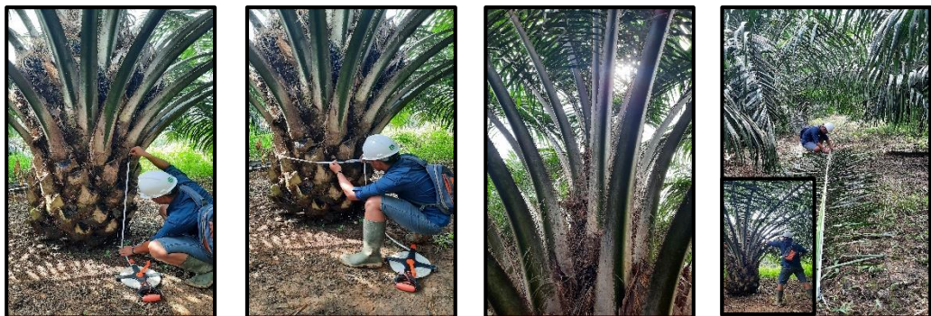
Pengamatan Blok G-36