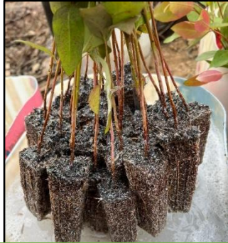
Aqualkir 3.3 gr/l