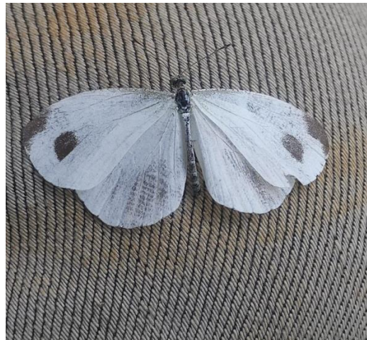
Foto serangga Leptosia nina

Lampiran 2. Foto Serangga di lokasi KP2 Ungaran