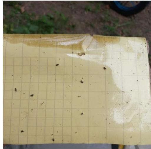
Penangkapan serangga menggunakan yellow trap