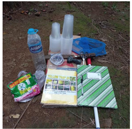
Alat dan bahan penelitian