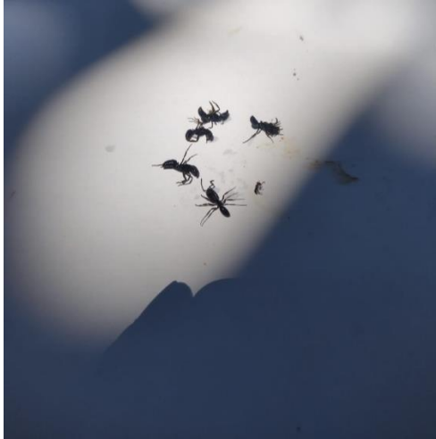
Foto serangga Pachycondyla