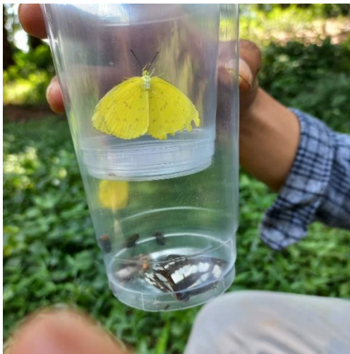
Hasil penangkapan serangga