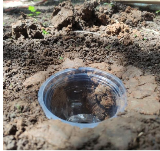
Foto penangkapan serangga menggunakan fitpel trap