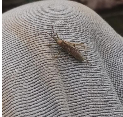
Foto serangga Leptocorisa oratorius