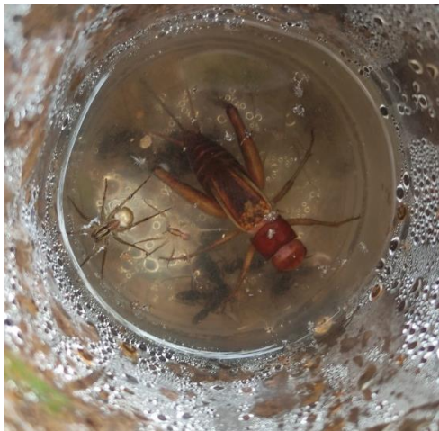
Foto serangga Gryllidae