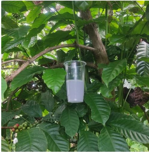
Penangkapan serangga menggunakan deterjen