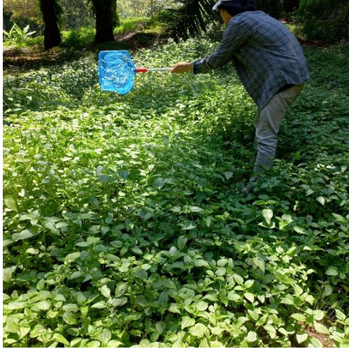
Foto penangkapan serangga menggunakan jaring