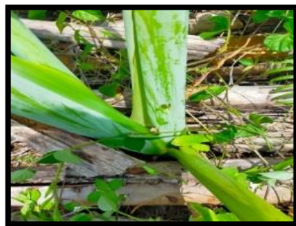
Metode cucuk lidi