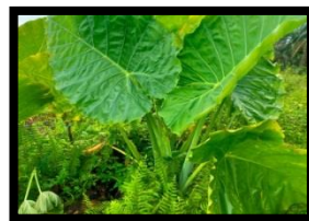
Colocasia esculenta L