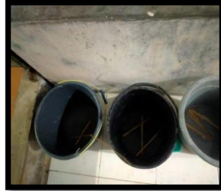
Perendaman cucuk lidi