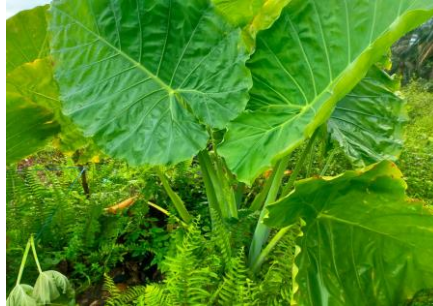
Gambar 1. Talas ( Colocasia esculenta L )