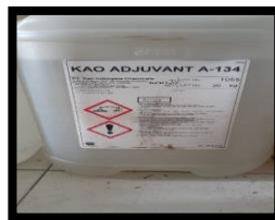
Polioksietilena alkil ester