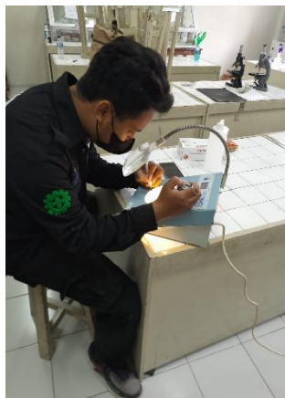
Penghitungan jumlah bakteri