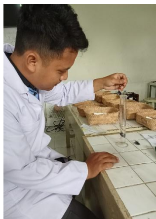
Pengukuran Berat Volume tanah