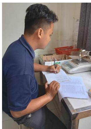
Pengukuran Berat Jenis tanah