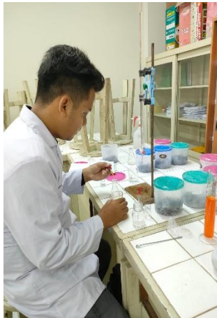
dititrasi sampel tanah