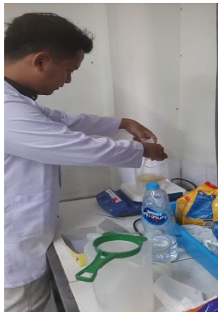
Pembuatan media agar