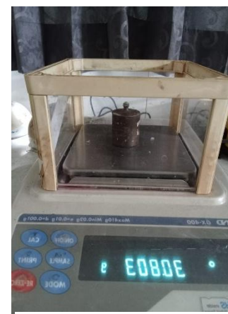
Pengukuran kadar air tanah