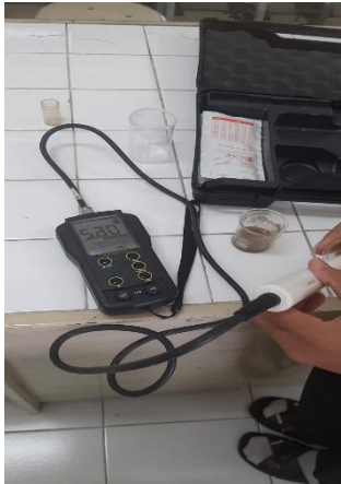
Pengukuran pH tanah