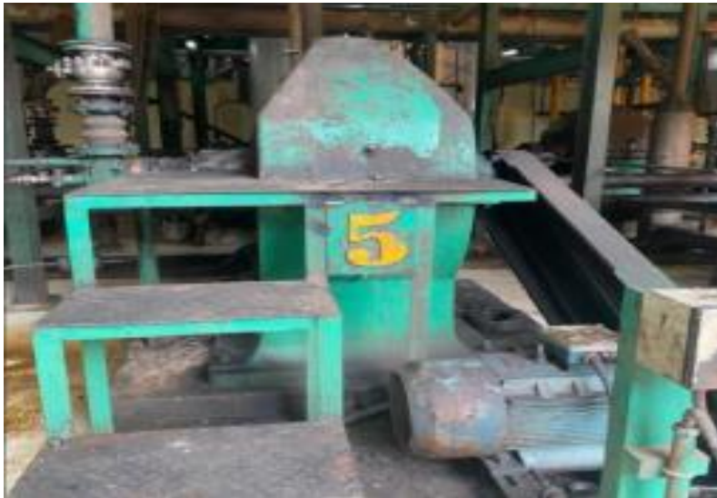
Lampiran 16. Pengambilan Sample Heavy Phase