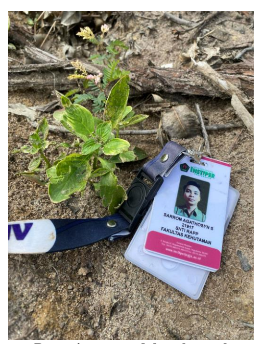
Borreria yang sudah terkontrol