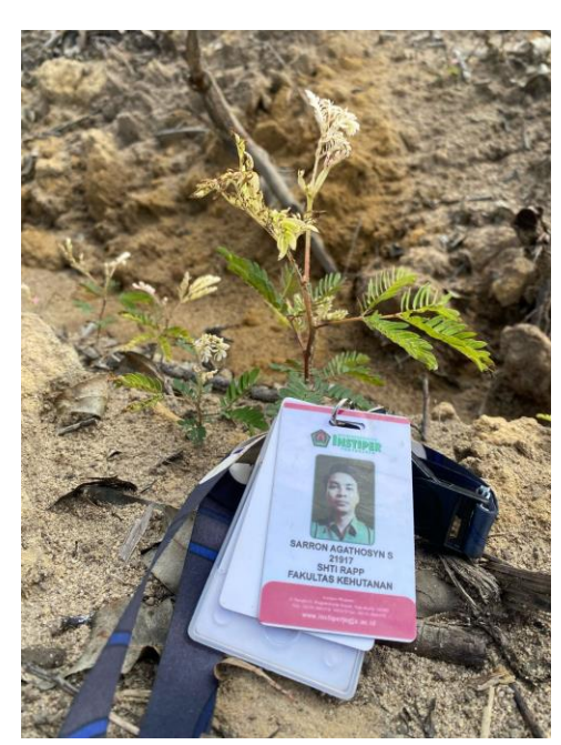
Anakan akasia yang sudah terkontrol