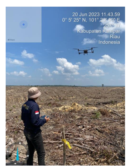
Penyemprotan areal 15 hektar Drone sprayer