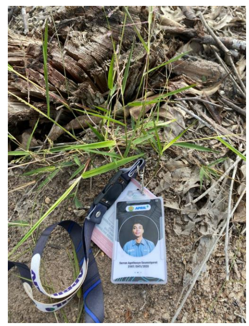
Rumput-rumputan yang sudah terkontrol