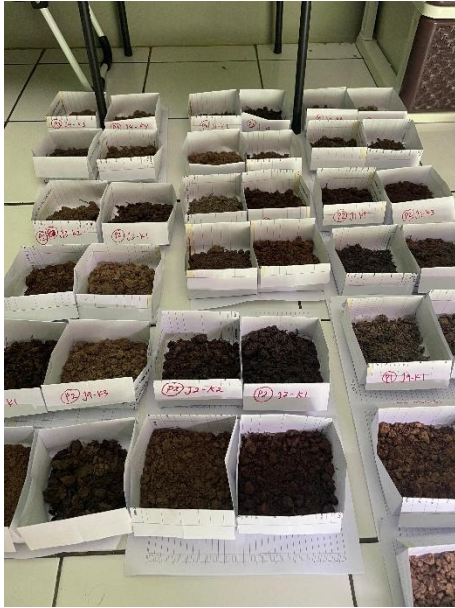
Proses kering angin