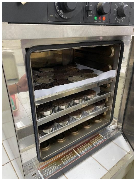
Proses pengovenan ring sampel tanah