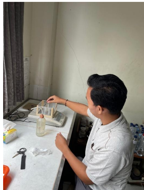
Proses penimbangan piknometer yang sudah mengendap semalaman