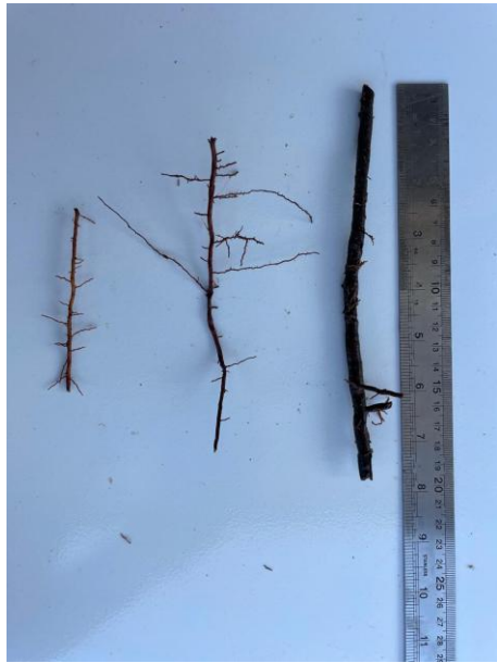
Akar primer, sekunder dan tersier