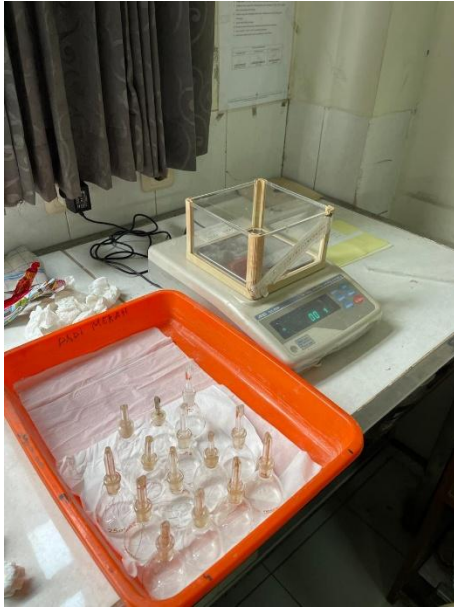
Persiapan alat piknometer untuk mencari berat jenis tanah