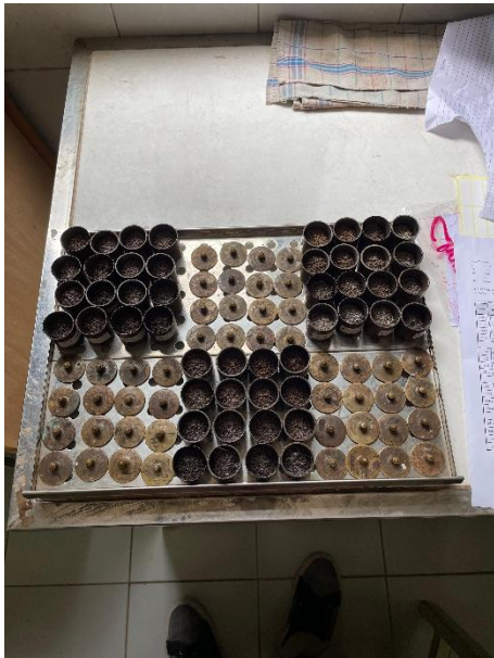
Pengovenan tanah yang sudah diayak menggunakan botol timbang