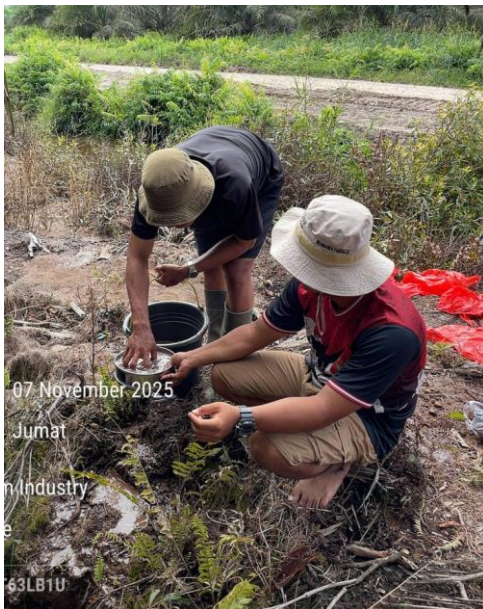
Pencucian atau pemisahan akar dengan tanah