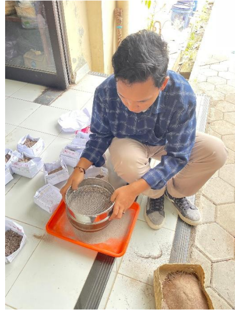
Pengayakan tanah yang sudah kering angin (2 mm)