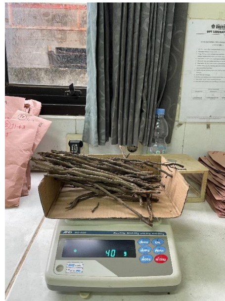
Penimbangan berat kering akar