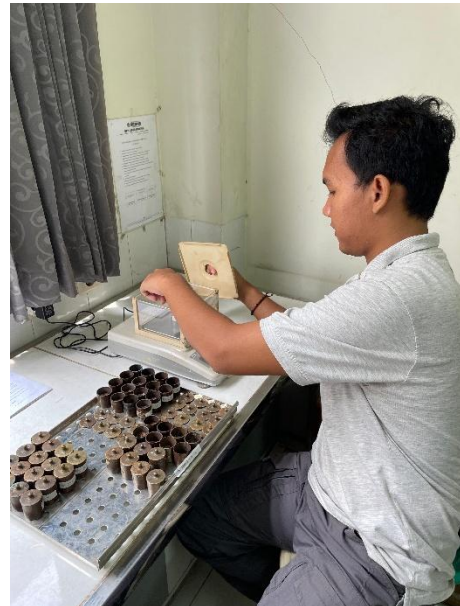
Penimbangan botol timbang yang telah di oven