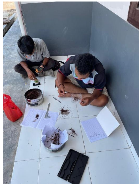
Proses penghitungan jumlah akar primer, sekunder dan tersier