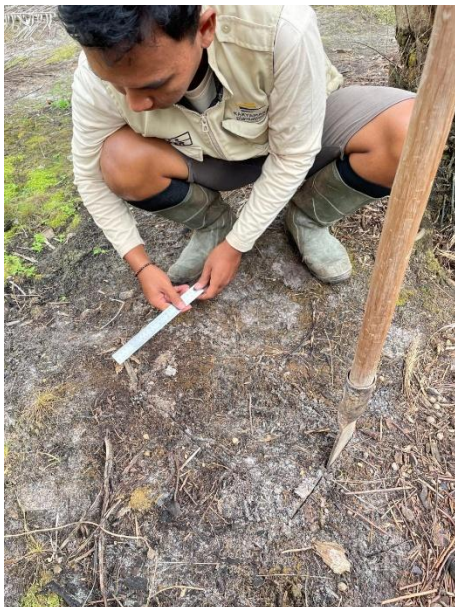
Pembuatan petak sampel