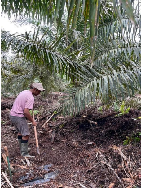
Pembersihan permukaan tanah