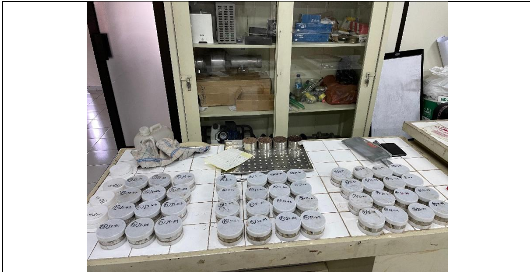
Persiapan pengovenan ring sampel tanah