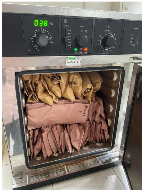
Proses pengovenan akar