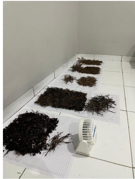
Proses kering angin