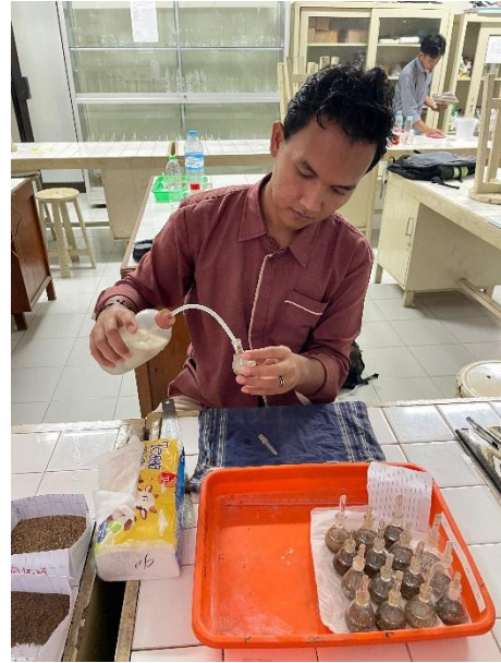
Proses pemasukan tanah yang sudah di ayak (2 mm) kedalam piknometer